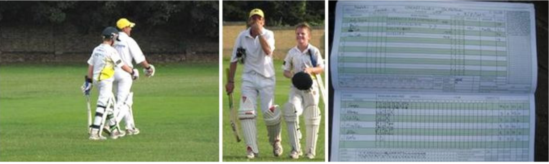
'Tate no prisoners!' Whilst it was just a social game played on a sleepy Sunday afternoon in West Hampstead, no Englishman was going to end this batting partnership!

Oh and it costs 12 pounds to play each week (about $20.00) so NCC players playing 18+ weeks a season should do the maths on that before next complaining about their annual fees!