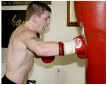
The Hattons...tremendous athletes all of them when drug free!