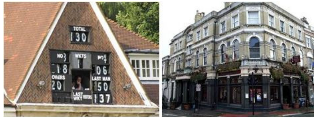
Left - Taties away! The partnership to steer the Ladder XI social cricket side home is under way! And right , the Railway Hotel in West Hampstead for the post-match debrief.